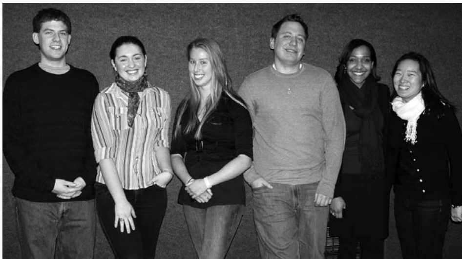
Recent alums returned to HCHS to share their experiences.

not necessarily the best or only option, to surround yourself with good people and get involved in something you're interested in.